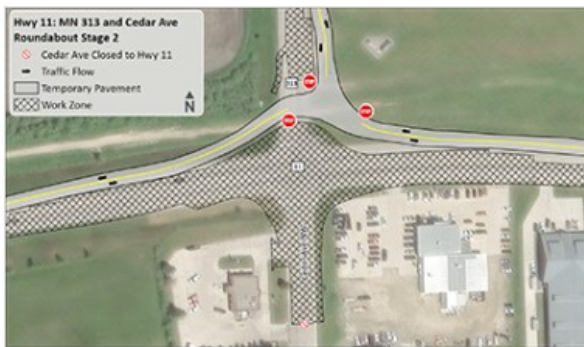
Stage 2: Cedar Ave. closed during construction

Please take note that there is construction going on in Warroad on Dairy Queen and Car lot corner, to turn onto Cedar Avenue, this route is closed.